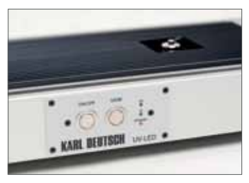
UV LED large area lamp operating panel